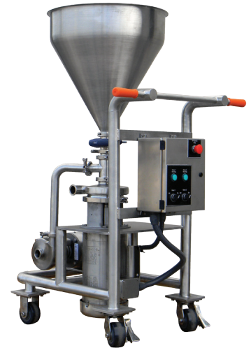
AC+ Dry Blender System